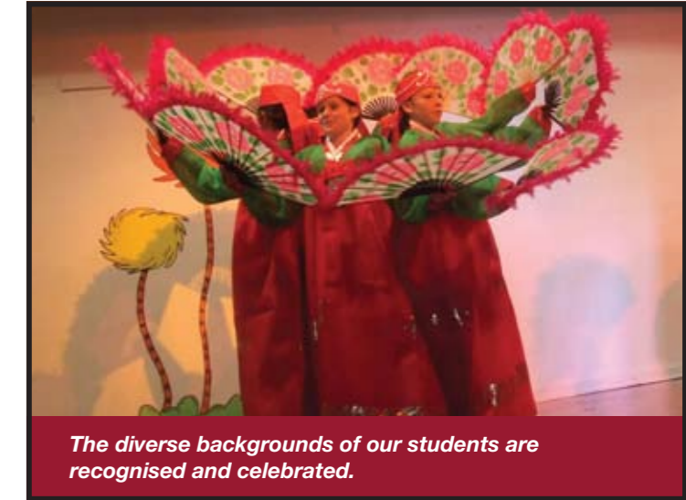
The diverse backgrounds of our students are recognised and celebrated.

Students are provided with the opportunity to learn something of the cultural heritage of other cultural groups. A number of experiences are provided including involvement in the choir and regular musical productions. An annual concert is held in which something of the diversity of our school and community is celebrated. On occasions, groups of students perform for community organisations and take part in interschool festivals.