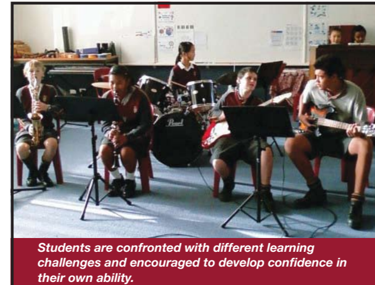
Students are confronted with different learning challenges and encouraged to develop confidence in their own ability.

School bands: Bands are for students who love to sing and play popular songs. Students also get to create their own songs and compete with others in events like Battle of the Bands and Rock Band Attack.