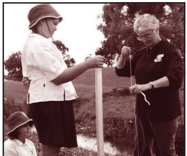
Expertise from outside the school assist students in exploring their inquiry focus.