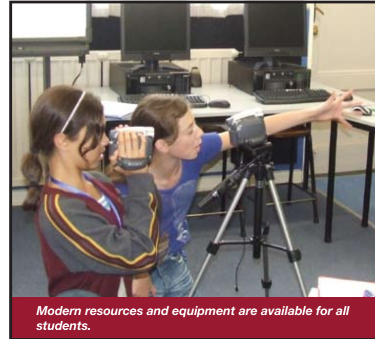
Modern resources and equipment are available for all students.

The school is fortunate to have a specialised arts team where the students have the opportunity to explore art, drama, dance and music. Each specialist teacher provides an inquiry-based programme where students are able to guide and manage their own learning, working towards creating and/or performing relevant pieces of work with a goal to achieve their social action. Students can also participate in various school activities including the school production and the Cultural Festival, as well as activities outside the school which include the APPA choir, Stage Challenge, Dance competitions and Art exhibitions.