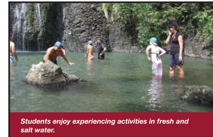
Students enjoy experiencing activities in fresh and salt water.