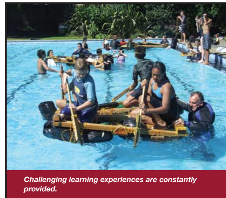
Challenging learning experiences are constantly provided.

Research has also suggested that students attending a school like Howick Intermediate have available to them a greater range of educational opportunities. In recognising the vital importance of this stage of a student's development, the school continues to seek new ways to increase the range of experiences appropriate to pre-adolescent students.