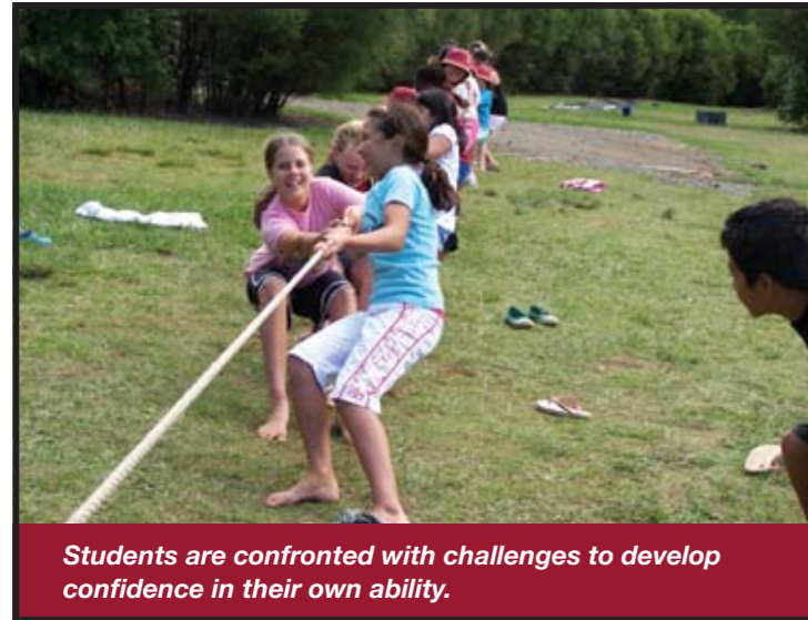
Students are confronted with challenges to develop confidence in their own ability.

The school is part of the Health Promoting Schools initiative which promotes and supports the health and physical well-being of children. As a school, we are aware of our obligations to assist students to enjoy a healthy life. In an attempt to encourage consistency between home and school, relevant information is made available regularly.