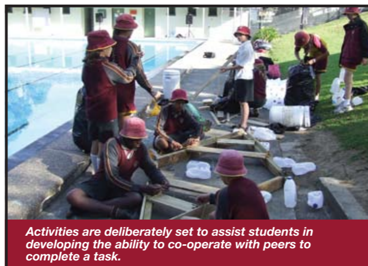
Activities are deliberately set to assist students in developing the ability to co-operate with peers to complete a task.

The integrative, inquiry-based model encourages students to participate, and prepares them to contribute to a democratic society, learning how to influence the world around them and contribute in a constructive way.