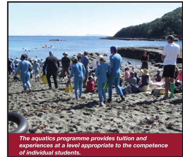
The aquatics programme provides tuition and experiences at a level appropriate to the competence of individual students.

Special-purpose camps may be held from time to time to support an aspect of the programme or the activities of a group within the school. Students involved benefit from a shared interest and the opportunity to be involved in an intensive over a weekend or a number of days. In the past music, drama and Maori culture camps have been held.