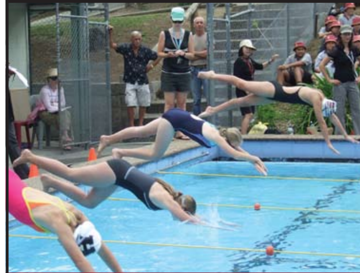
Students are involved in an extensive sporting programme.

A wide range of sporting activities is provided. The school's pool is a special feature of our school environment and is used extensively as a part of the Physical Education programme. The school swimming programme is compulsory as we want all students to learn to swim. The school has ready access to the Howick Recreation Centre. An extensive interschool programme in a variety of sports is organised annually.