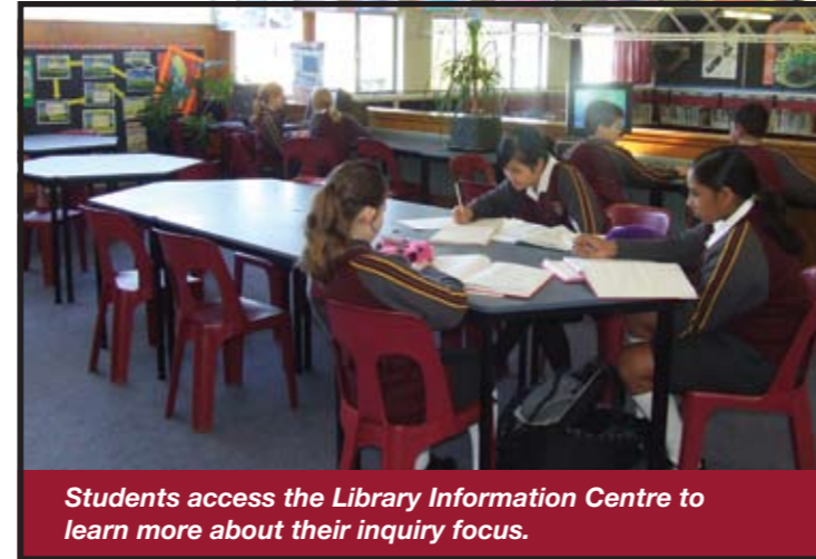
Students access the Library Information Centre to learn more about their inquiry focus.

At the heart of our school and the inquiry-based programme, is a fully-resourced Information Centre where both staff and students can have ready access to information. An excellent up-to-date library of fiction and resource books exists to support inquiry-based programmes. The library utilises a computerised circulation/inquiry system (Alice), with students encouraged to make full use of the facility. Attractively located on two floors, the library also contains a number of computers with internet access to support research and a photocopier is available for student use. Student librarians are selected and trained to assist the school librarian. These students can be seen performing their duties at lunchtimes when the library is buzzing with activity. The Library and Information Centre hours are extended beyond teaching hours.