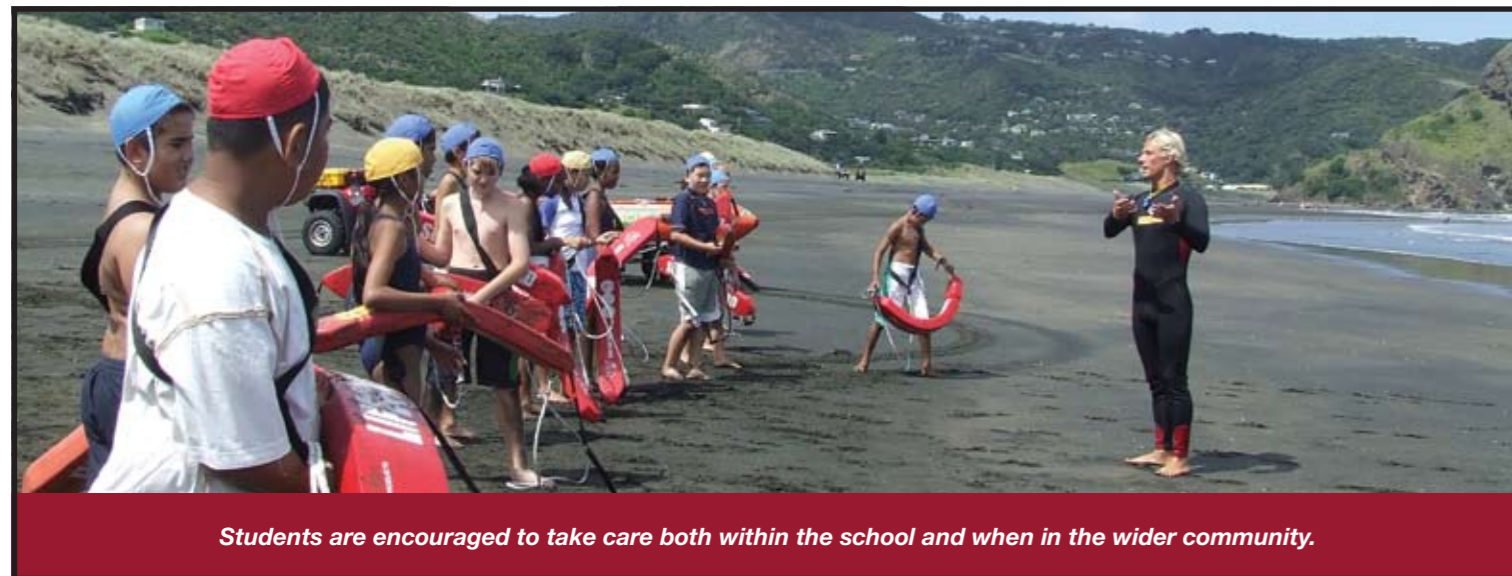
Students are encouraged to take care both within the school and when in the wider community.

The school is well equipped with computer technology and support amenities. Information and Computer technologies are a set of digital tools and resources that students learn how to operate and use for a variety of purposes. They are able to utilise a range of programmes to complement classroom activities and add further dimension to learning outcomes.