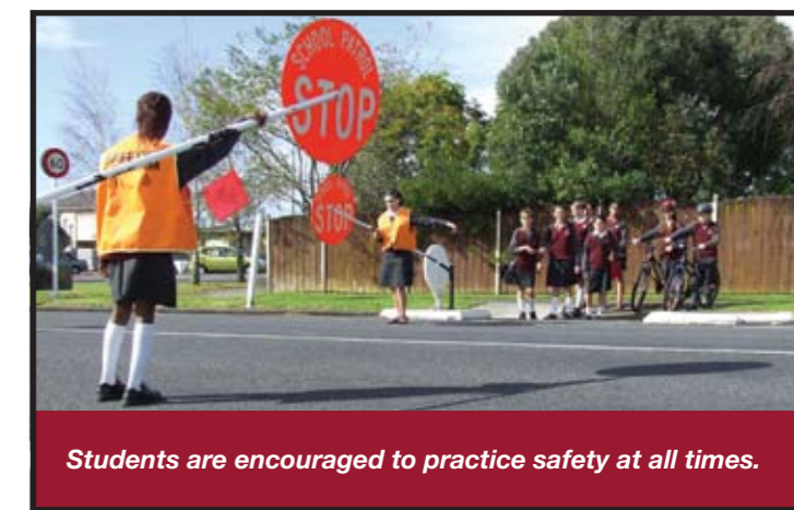
Students are encouraged to practice safety at all times.

Bicycles must comply with road safety regulations. Our school requires students to have knowledge of safe practices when riding a bicycle. Students must have written permission to use a bicycle and must ensure that it is road-worthy. While cycle racks are provided and there is normal supervision of the bicycle area, our school cannot accept responsibility for bicycles brought to school. Locks are essential.