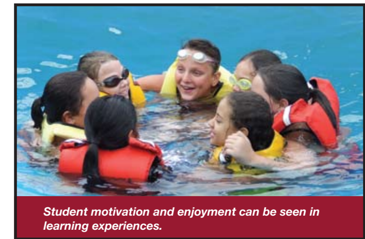
Student motivation and enjoyment can be seen in learning experiences.

Our school recognises that learning occurs in a variety of places and situations. Outings are encouraged and organised whenever appropriate to the inquiry-based programme. When students are leaving the school on a trip, parental approval will be sought and organisational details made available.