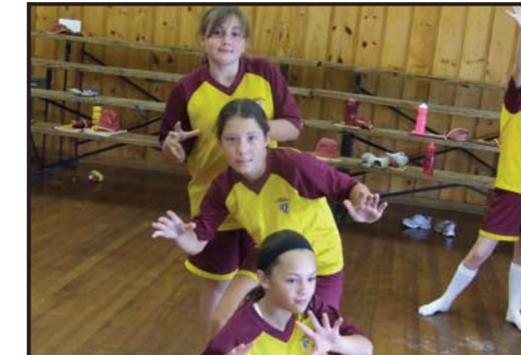
Group activities enable students to pursue their own interests yet also learn from each other.

This includes painting, pottery, drawing, print-making, collage and an introduction to the history of art. Students are given the opportunity to explore their potential through the development of skills and knowledge via a range of media and experiences. An addition to the Art Studio is the "Digital Art Zone" where students explore multi-media and graphic design.