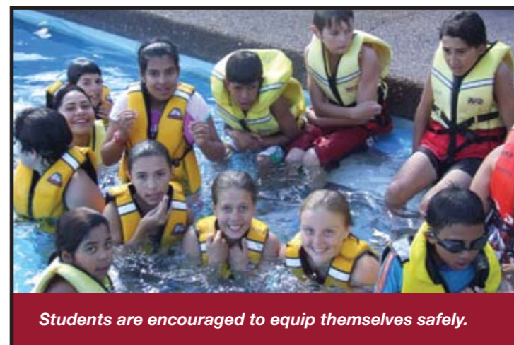
Students are encouraged to equip themselves safely.

Special reports and daily or weekly reporting to assist the progress of individual students, can be arranged.