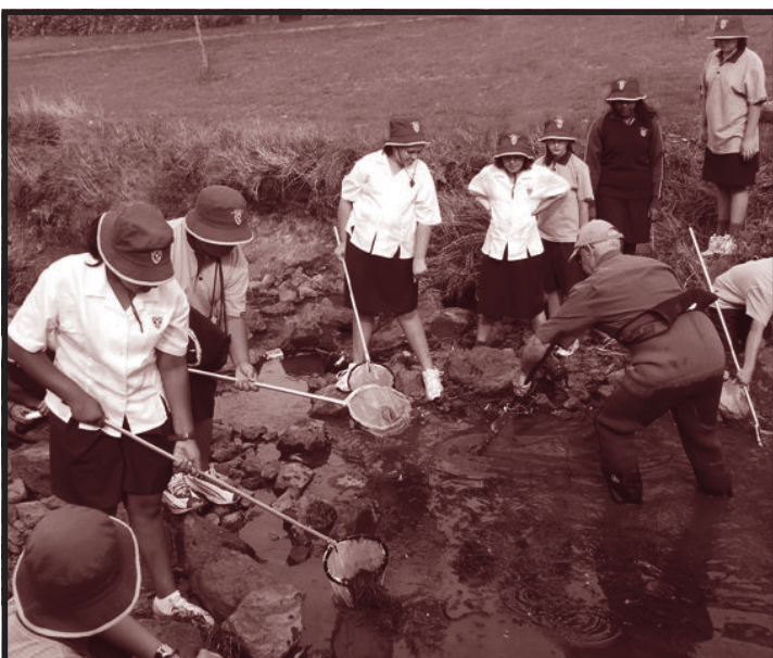
Students actively involve themselves in issues that threaten their community.

During this time the students will cover selected achievement objectives from the New Zealand curriculum, integrating as many curriculum areas as their questions promote. The teacher's job is initially, with the students, to help recognise the skills and knowledge each student will need in their Inquiry process and then to help them plan when, how and from whom they will receive their lessons. Students can get expert knowledge from any of our staff, or the outside community. They get lessons that are relevant to them. They get lessons in small groups or individually. They get lessons at their level, extending them where appropriate. They get lessons challenging them to think, use their values, be organised and be ready for the real world. They get lessons teaching them how to be life long-learners and be ready for a future that we can only imagine.