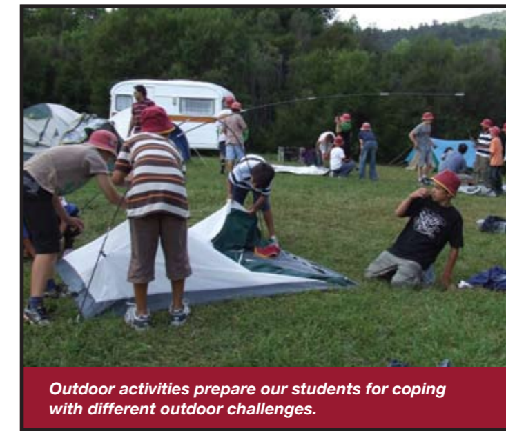
Outdoor activities prepare our students for coping with different outdoor challenges.

The school has a well-established camping programme which enables students to experience learning situations not easily provided within the normal school setting. The school has acquired a large supply of equipment and resources to support these activities. An extensive aquatics programme is run bi-annually. With all outdoor education activities, a careful assessment of the risks is completed and parents informed about the programme. Suitable supervision is provided.