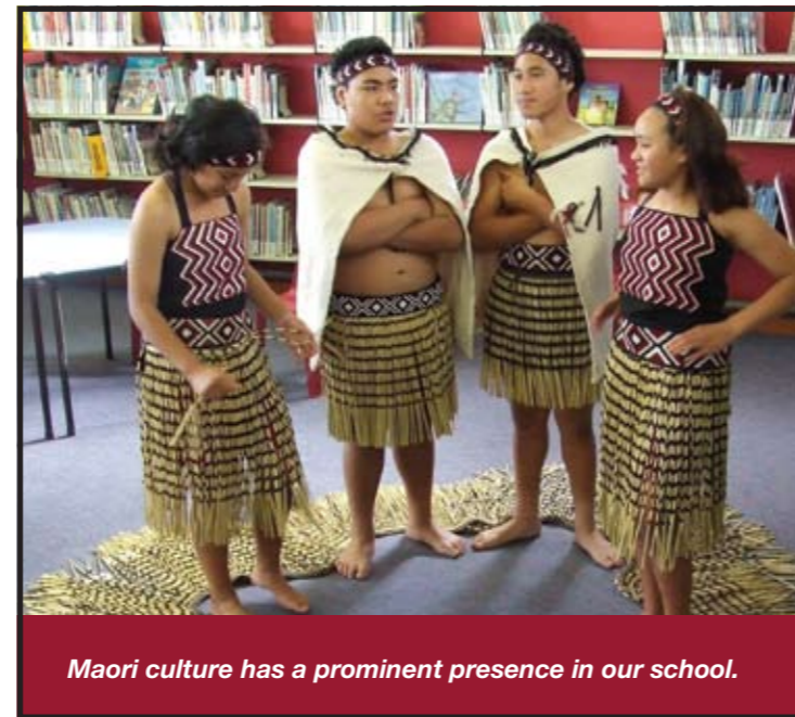
Maori culture has a prominent presence in our school.