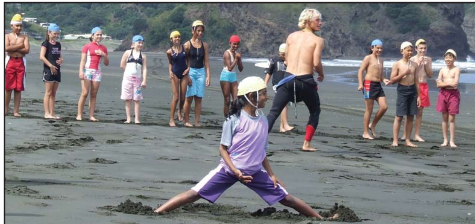
Expert help is accessed for providing tuition in a variety of settings.

The Academy identifies students who display natural athletic abilities. It provides intensive training programmes that maximise individuals' sporting potential, provides opportunities and experiences to further develop team-building skills, attitudes, self