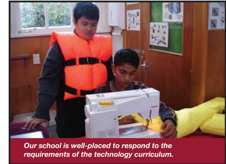
Our school is well-placed to respond to the requirements of the technology curriculum.

We place great importance on providing further opportunities for students possessing special abilities, or revealing a level of creativity or giftedness. Special programmes and classes are provided for these students.