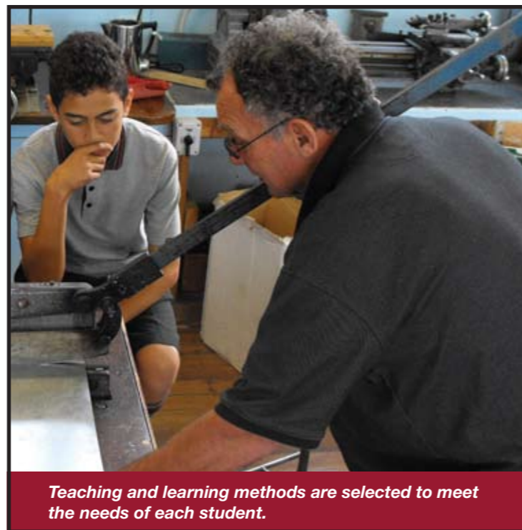
Teaching and learning methods are selected to meet the needs of each student.

Our school has invested heavily in acquiring technic Lego equipment. This is used to assist students in coming to understand complex scientific and mathematical concepts. These resources are also used to make more realistic, problem solving experiences. In the future, some students will have the opportunity to take this learning further, developing an understanding of how computers can be programmed to control machines.