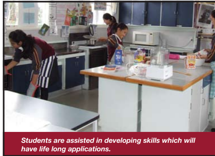
Students are assisted in developing skills which will have life long applications.