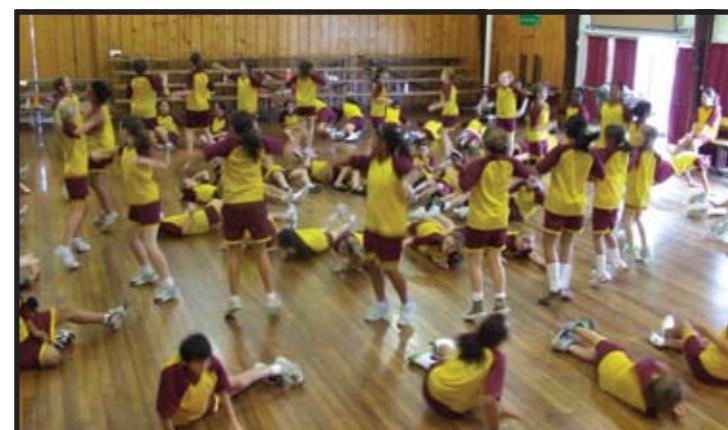
Students can participate in a variety of schoolwide performing arts activities.

Students are taught and encouraged to set realistic goals and are assisted by staff to achieve them. This forms an important part of becoming an independent learner.