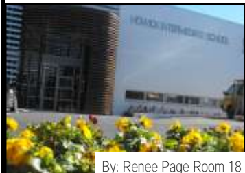
By: Renee Page Room 18

Over 1500 seedlings were planted to create a spectacular display.