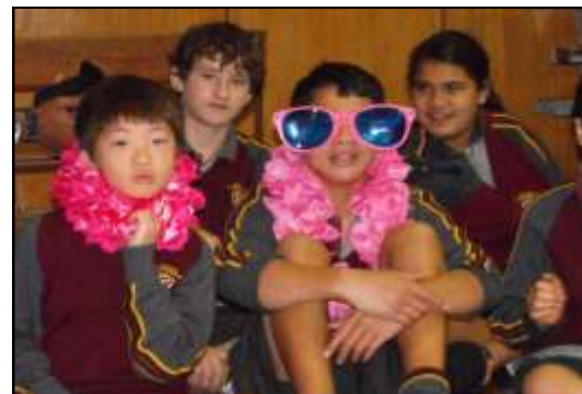
Above: Students supporting their whanau

It was a great way to end the term and students were beaming—what a way to end the term!