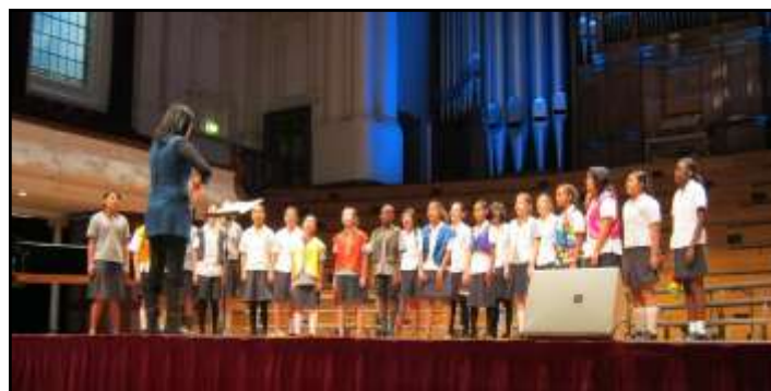
The Choir practicing in the Town Hall

It was a great evening with schools from all over Auckland being represented.