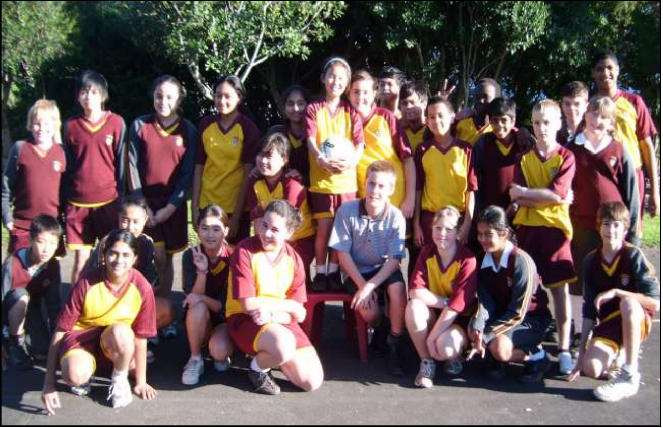
Congratulations to Room 20 for receiving the Red Card Shield. Keep up the effort of being caught being good!

Red Cards are issued to students who are 'caught' doing something good. The class with the most red cards wins the Red Card Award for the week. Students who win a red card automatically go into the draw to win a giant cookie.