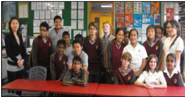
Week 7: Room 6