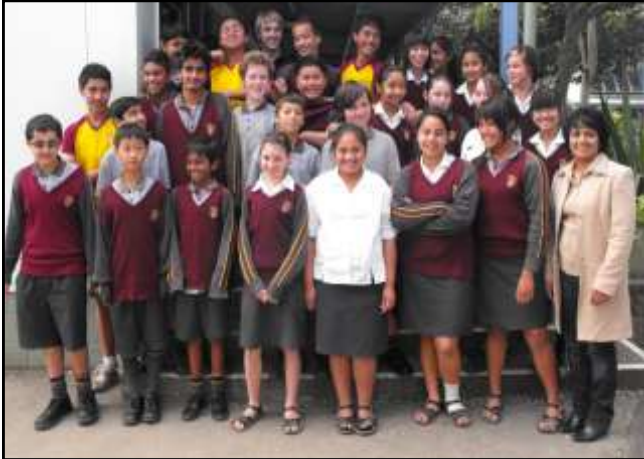
Week 5: Room 14

Red Cards are issued to students who are 'caught' doing something good. The class with the most red cards wins the Red Card Award for the week. Students who win a red card automatically go into the draw to win a giant cookie.