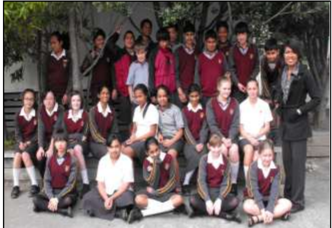
Week 6: Room 16