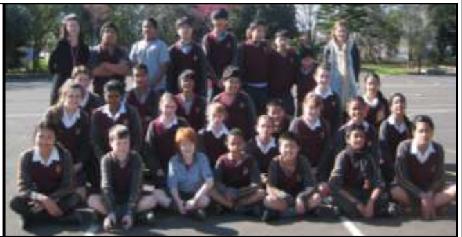
Week 8: Room 18

Congratulations to these classes for receiving the Red Card Shield. Keep up the effort of being caught being good!