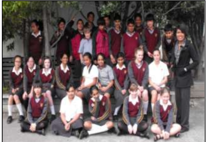
Week 6: Room 16