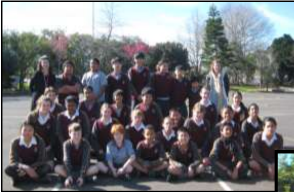
Week 3: Room 18

Red Cards are issued to students who are 'caught' doing something good. The class with the most red cards wins the Red Card Award for the week. Students who win a red card automatically go into the draw to win a giant cookie.