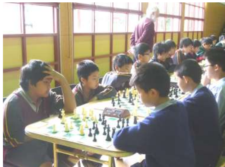
PHOTO: Chess team hard at work on their game