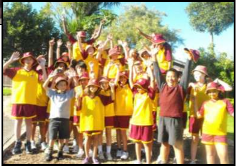
Week 4: Room 9

Congratulations to Room 18 in Week 3 and Room 9 in Week 4 for receiving the Red Card Shield. Keep up the effort of being caught being good!