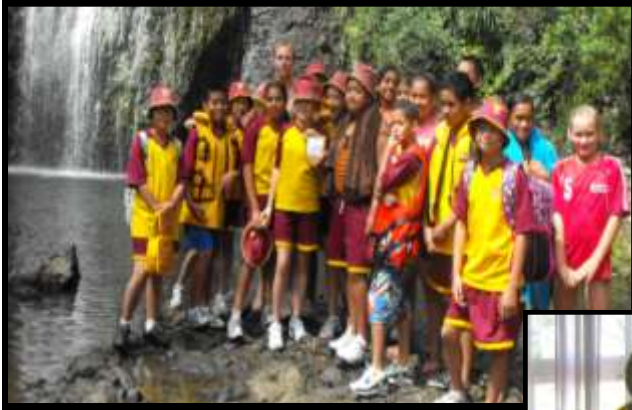
Above: Rm 7 Red Shield winners for Week 5

Red Cards are issued to students who are 'caught' doing something good. The class with the most red cards wins the Red Card Award for the week. Students who win a Red Card automatically go into the draw to win a giant cookie.