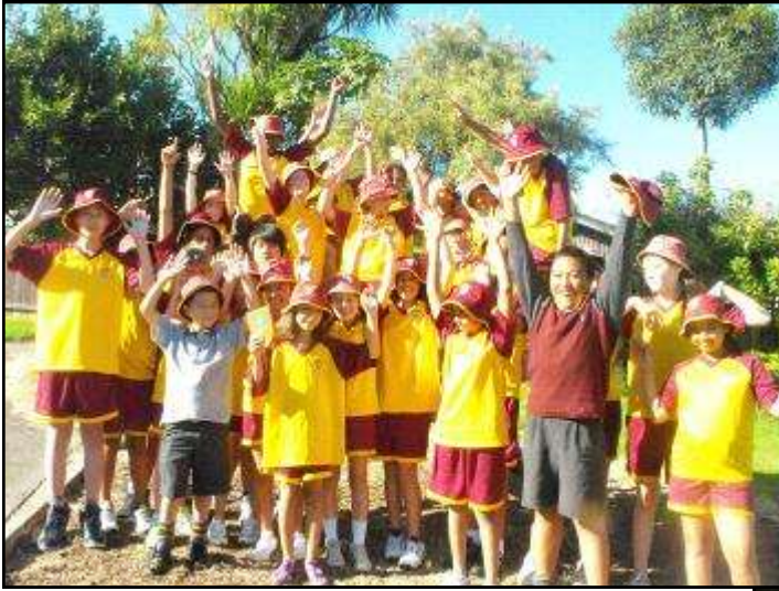
Above: Rm 9 Red Shield winners for Week 7

Red Cards are issued to students who are 'caught' doing something good. The class with the most red cards wins the Red Card Award for the week. Students who win a Red Card automatically go into the draw to win a giant cookie.